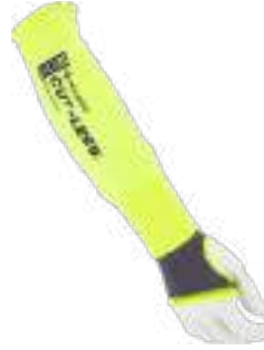
3142-14THY | 3142-18THY

3142-18TH 18" Cut-Less® Korplex® Cut Resistant Sleeve w/ Thumb Hole, ANSI A4