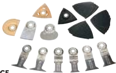
26-PIECE BEST OF STARLOCK RENOVATION PART NUMBER: 35222967060